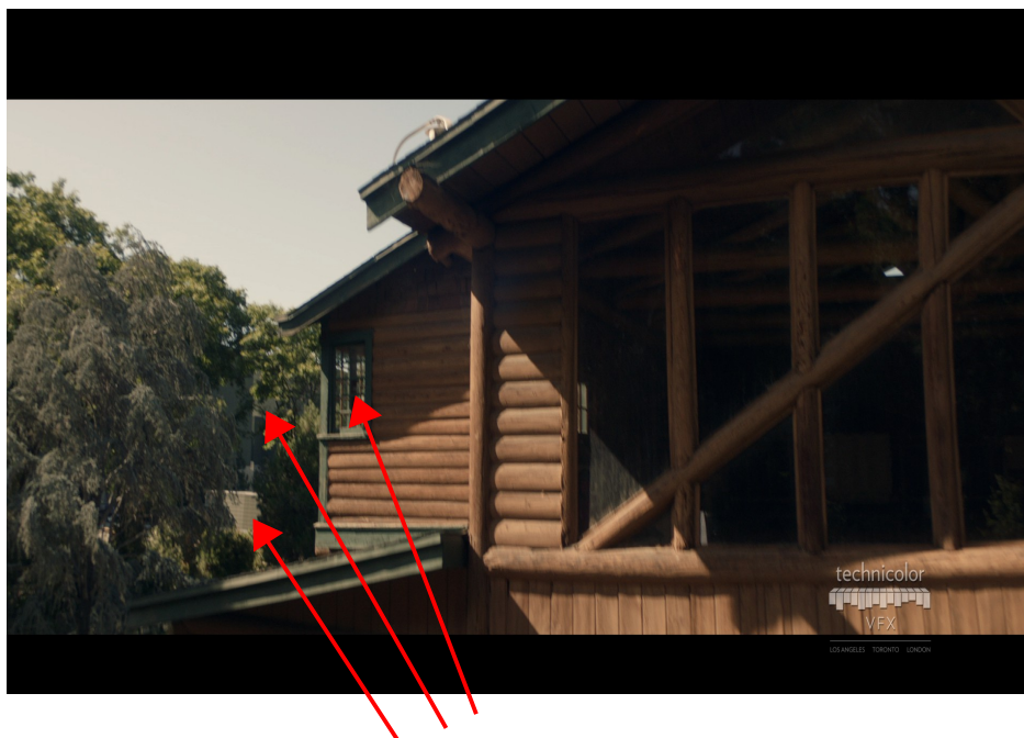
Building removal/Tree fill 3D Camera Tracking (Nuke)