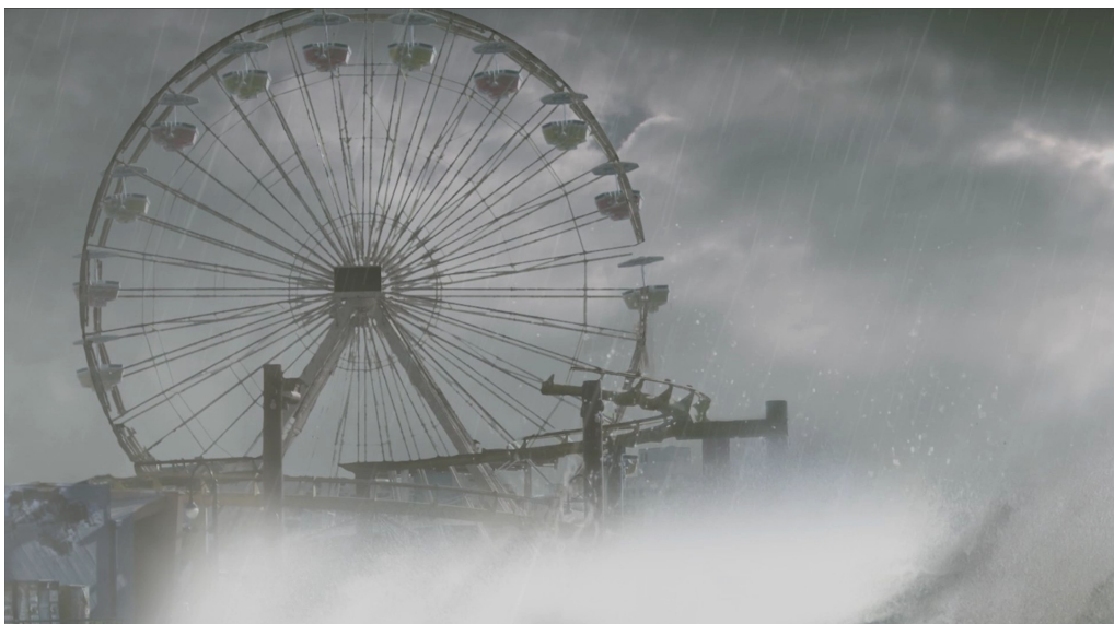
LIFE AFTER PEOPLE SANTA MONICA PIER: Created Matte Painting Layered, Colored, Animated and Composited Final Shot (After Effects, Photoshop)