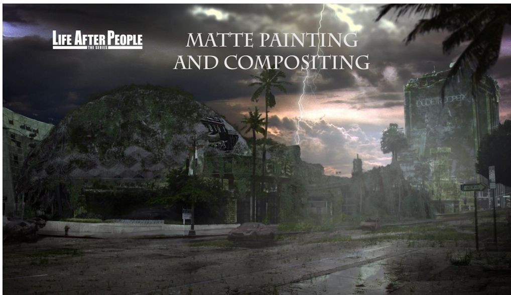
LIFE AFTER PEOPLE Colored and layered photo matte painting Composited After Effects Rain particular system Final Composition (After Effects, Photoshop)