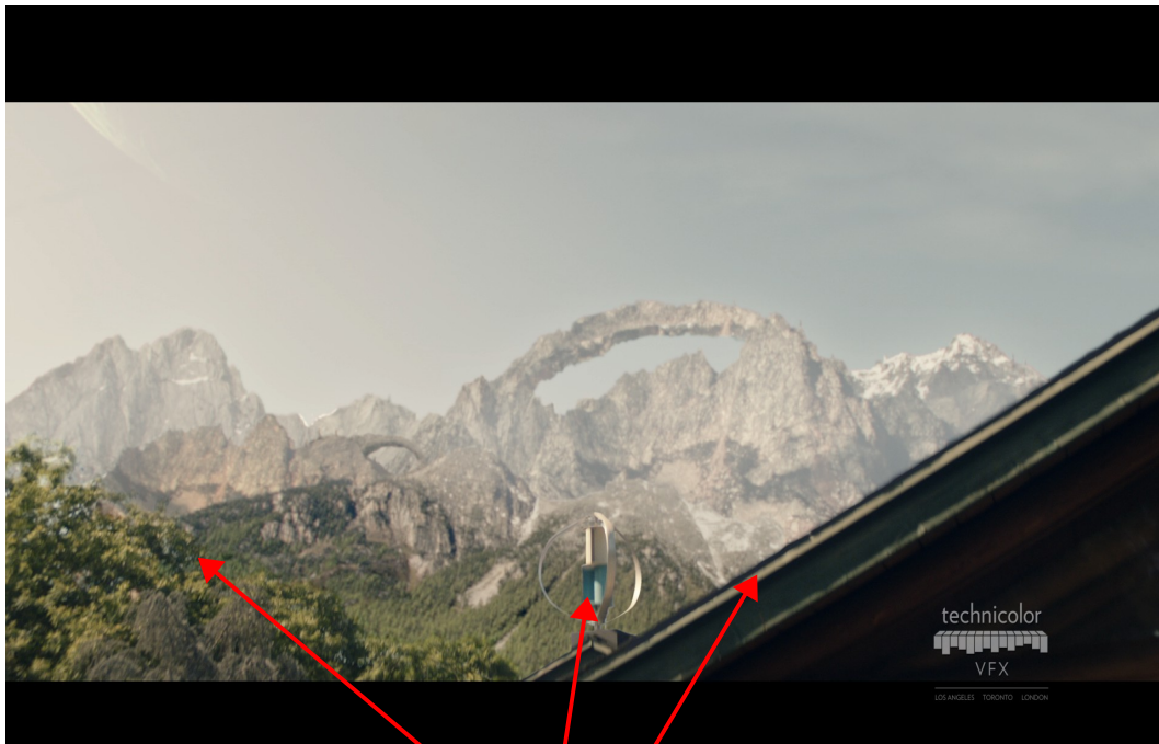
Edge replacement and refinement Mountain and Moons matte painting treatments (Nuke)