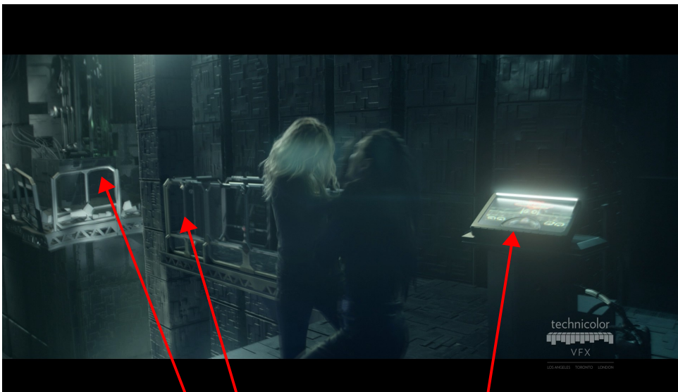
Blue Screen Extraction Mid-Ground Extensions Composited CG for Background Composited CG for Table Display (Nuke)