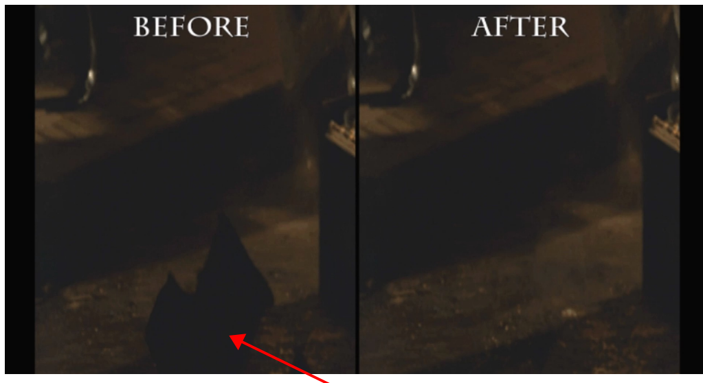
THE GODFATHER PART II Camera tape removal (After Effects, Combustion)