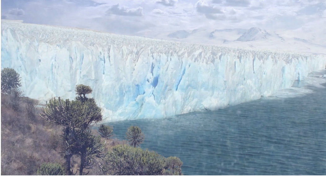
EARTH SPIN AND ICY AFRICA: Created Africa and Frozen Glacier Matte Painting, composited transition (After Effects, Photoshop)