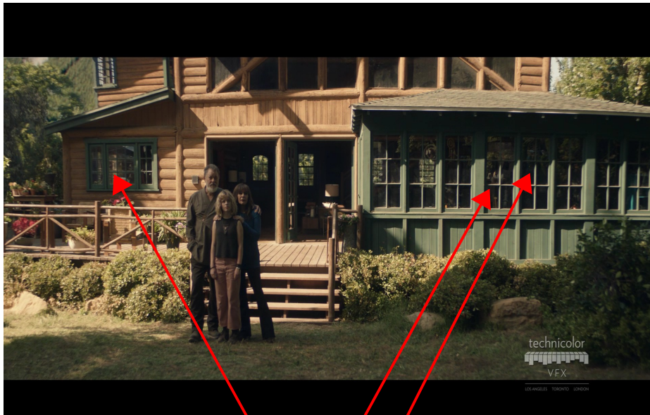
STAR TREK: PICARD Crew and Gear Reflection Removal (Nuke)

http://patrickalmanza.com/html/REEL-2020.html