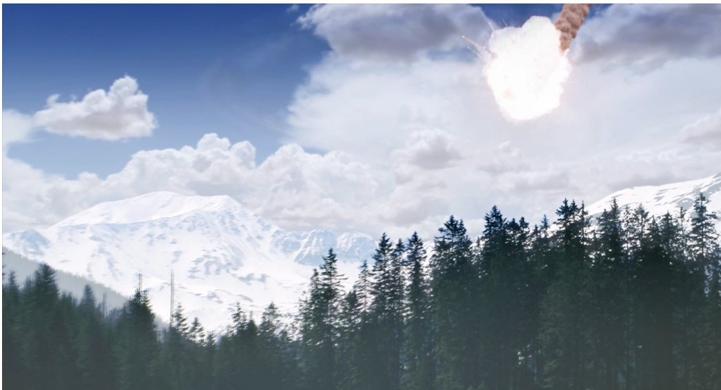
SNOWY MOUNTAIN BLAST: Created Matte Painting Layered, Colored, Animated and Composited Final Shot (After Effects, Photoshop)