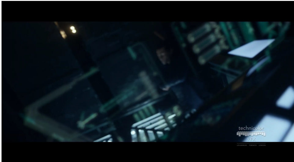
Tracked, created Rack focus and composited CG computer display. (Nuke)