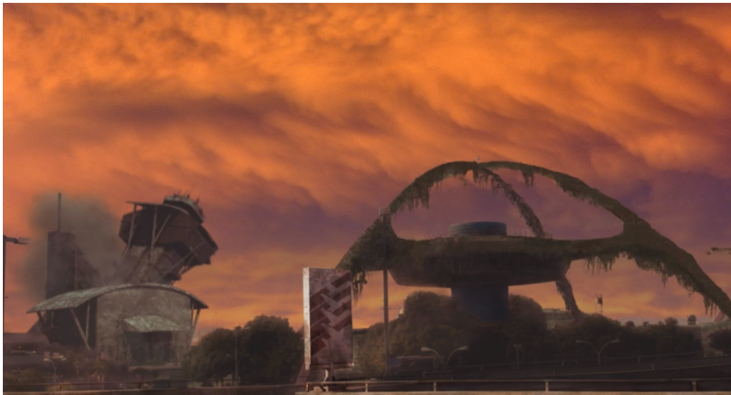
LOS ANGELES INTERNATIONAL AIRPORT: Created Matte Painting Layered, Colored, Animated and Composited Final Shot (After Effects, Photoshop)