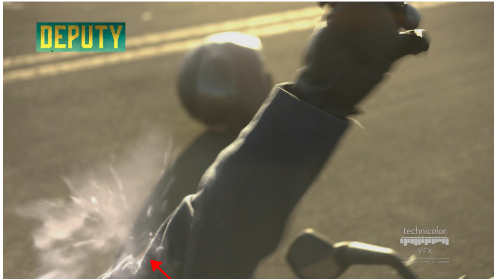
DEPUTY Painted Tear Composited explosive particular elements (Nuke)