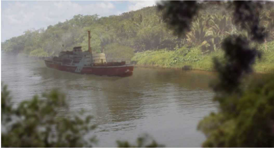
THE UNIVERSE SHIP ON ICE TO JUNGLE: Rotoscoped, colored, painted and composited scanned plates through transition. (After Effects, Photoshop)