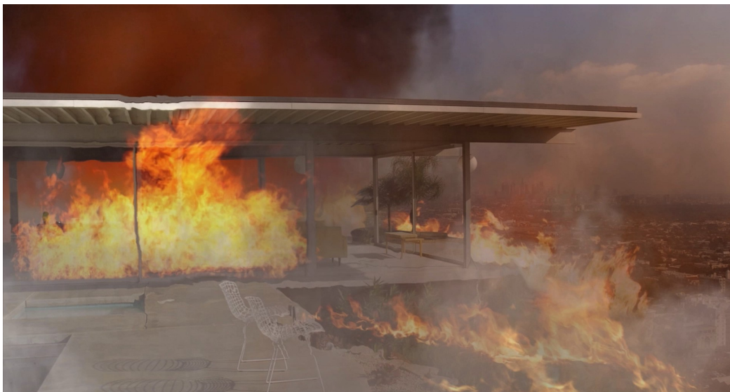
BURNING HOLLYWOOD HILLS HOME: Created Matte Painting Layered, Colored, Animated and Composited Final Shot (After Effects, Photoshop)