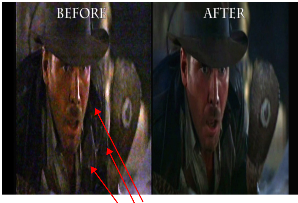
RAIDERS OF THE LOST ARK Cobra and fire reflection removals Scratch Removal (After Effects, Combustion)