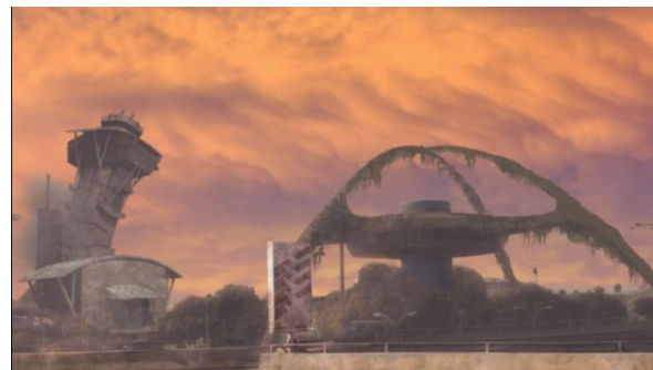
LAX: Colored and layered photo, composited Maya asset of falling tower with my matte painting.