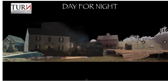
TURN: WASHINGTON'S SPIES: Created Day for night matte painting for use in multiple shots