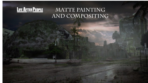
CINERAMADOME: Colored and layered photo, composited AE rain, lightning and fog and rat