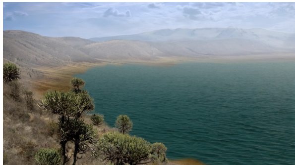
EARTH SPIN AND ICY AFRICA: Created Africa and Frozen Glacier Matte Painting, composited transition