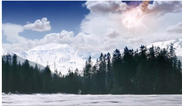
SNOWY MOUNTAIN BLAST: Created Matte painting, composited with 2D and CG 3D comet tail elements