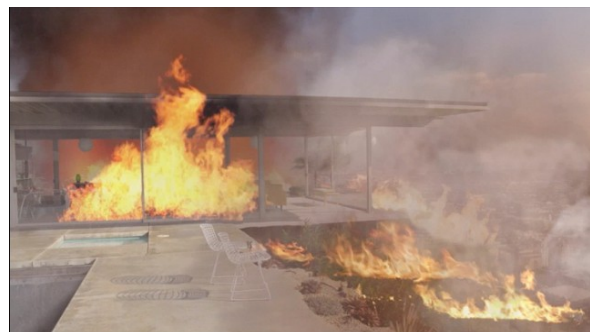
BURNING HOLLYWOOD HOUSE: Created matte painting; layered, and composited entire shot.