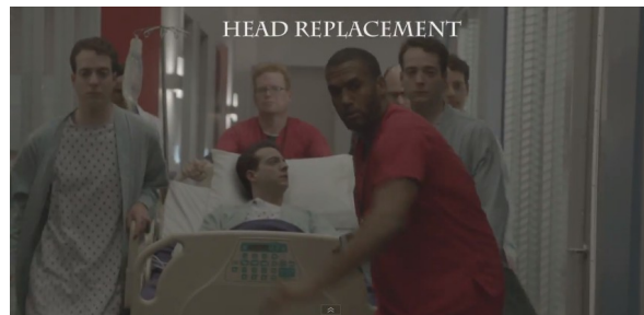
BLACK BOX: Replaced Heads of man screen left and man in gurney.