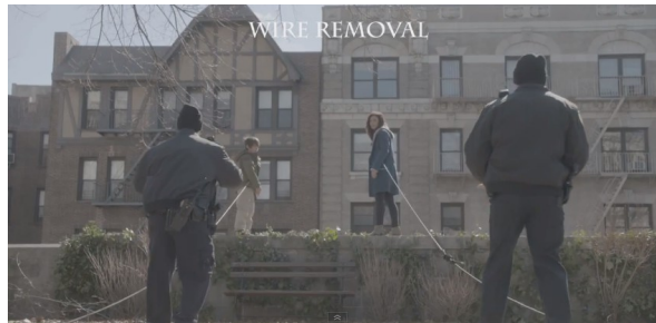
BLACK BOX: Removed both wires