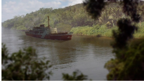
SHIP ON ICE TO JUNGLE: Rotoscoped, colored, painted and composited scanned plates through transition.