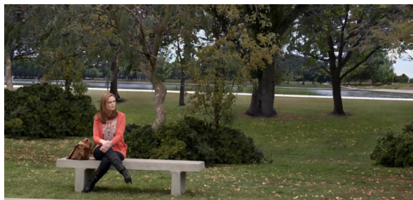
BONES: Created matte paintings for subsequent shots