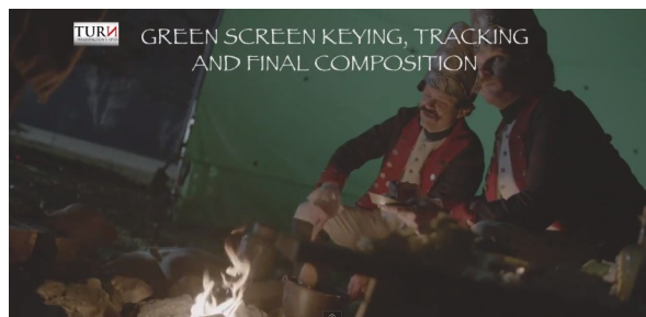
TURN: WASHINGTON'S SPIES: Removed Green Screen, Composited and colored BG groups, created BG matte painting, tracked and executed final composite