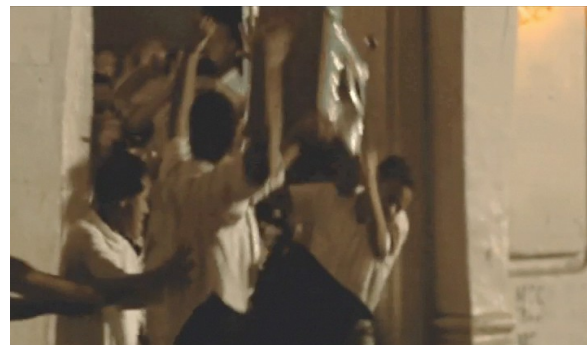
GODFATHER II CAMERA TAPE REMOVAL: Painted out tape on the camera lens through a sequence of shots.