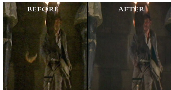
RAIDERS FIRE REFLECTION: Painted, colored and composited to remove fire reflections.