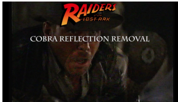
RAIDERS COBRA REFLECTION: Painted, colored and composited to remove reflections on Indy.